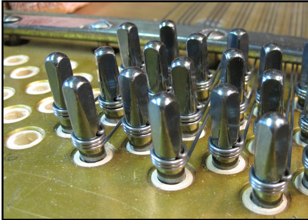
New tuning pins and strings being installed.

When the tuning pins of a piano become loose and tend to slip, the piano will not stay in tune for a reasonable amount of time. When the strings have deteriorated to the point where they are breaking frequently, the tone of the piano will usually suffer as well. Your piano is showing symptoms of problems caused by brittle strings and loose pins which could be lessened or eliminated if your piano were to be repinned and restrung.