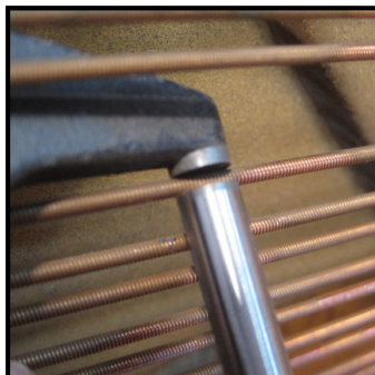
Miking the copper winding.

With your set of strings complete, your piano will have a fuller sound once again. Keeping on top of needed repairs will keep your piano in good playing condition so that it may be enjoyed to the fullest.