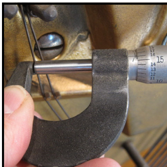
Miking the core wire.