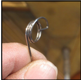
Making a new coil.

After a universal string with the correct core wire diameter and copper winding size is selected, the extra winding will be removed to match the length of the winding on the original string. (Universal strings come with a hexagon steel core wire which will firmly grip the end of the copper winding to prevent further unraveling.) A new coil will then be put on the end of the replacement wire and the wire will be installed in the place of the missing string, as in the photo below.