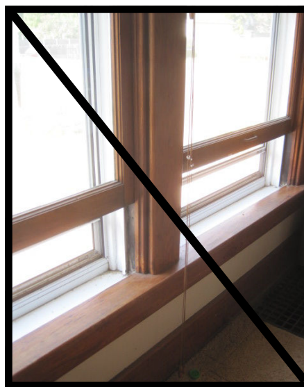
2. Drafty windows.

Note: Effective humidity control equipment, either for the home in general or the piano in particular, will aid in keeping your piano in top form.