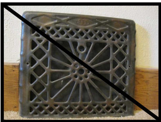
1. Hot air registers—dry, heated air blowing directly on the back of a piano is particularly bad for the soundboard.

Environment: While tuning, repairs and regulation are the job of the technician, seeing to it that your spinet piano is placed in an appropriate spot within your home is up to you. What is needed, as much as possible, is a location where temperature and humidity are kept at moderate levels year-round. Drafty locations or areas where wide swings in either temperature or humidity occur (unheated porches, moldy basements, etc.) are unsuitable for a piano. In particular avoid placing your piano in front of either of the following if at all possible: