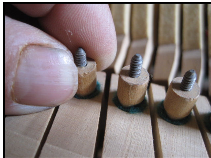
Adjusting lost motion with a fine touch.