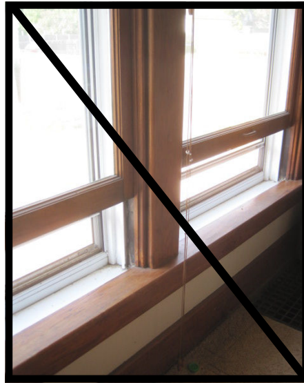
2. Drafty windows.

Note: Effective humidity control equipment, either for the home in general or the piano in particular, will aid in keeping your piano in top form.